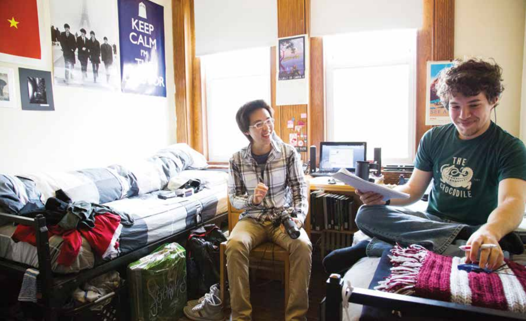
Eight coeducational houses (Main, Raymond, Davison, Lathrop, Jewett, Josselyn, Cushing, and Noyes) are home to the majority of freshmen, sophomores, and juniors on campus. There is also one cooperative (Ferry House), and one hall for women only (Strong House).