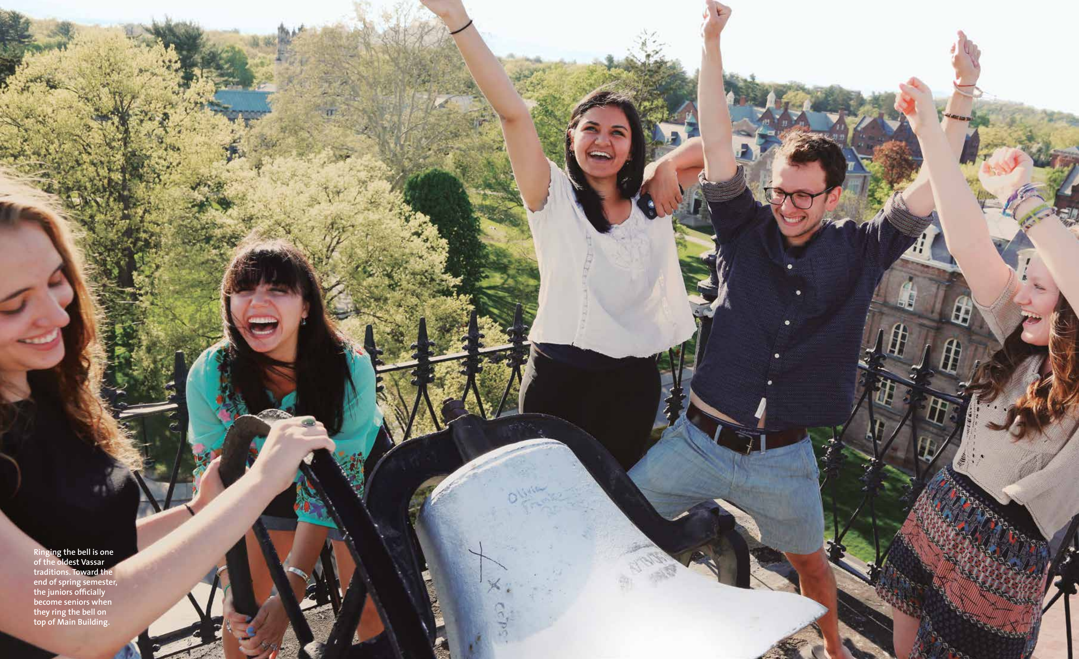
Ring the bell is one of the oldest Vassar traditions. Toward the end of spring semester, the juniors officially become seniors when they ring the bell on top of Main Building.