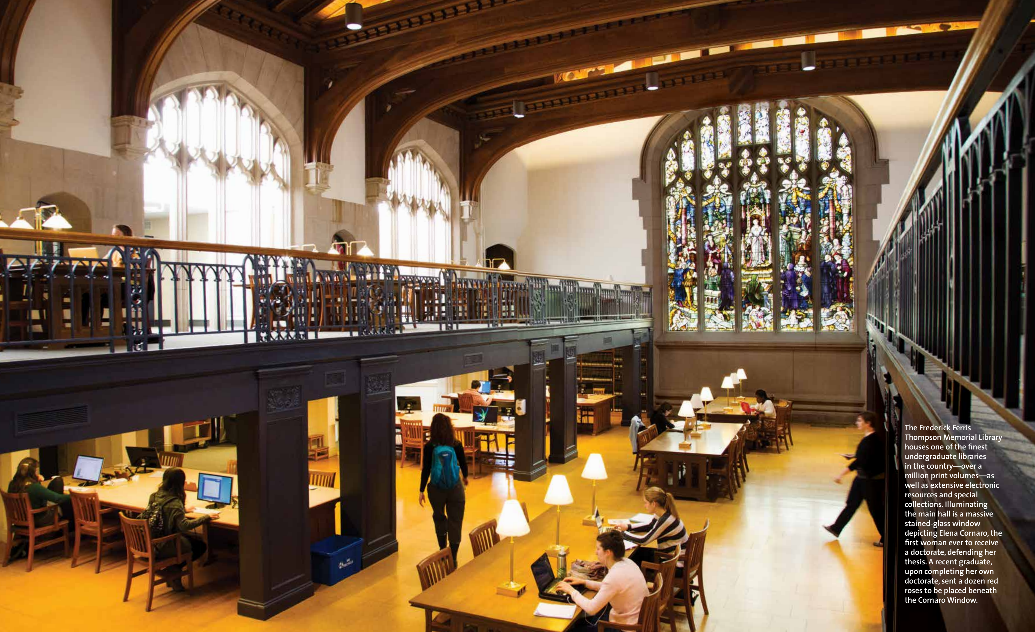
The Frederick Ferris Thompson Memorial Library houses one of the finest undergraduate libraries in the country—over a million print volumes—as well as extensive electronic resources and special collections. Illuminating the main hall is a massive stained-glass window depicting Elena Cornaro, the first woman ever to receive a doctorate, defending her thesis. A recent graduate, upon completing her own doctorate, sent a dozen red roses to be placed beneath the Cornaro Window.