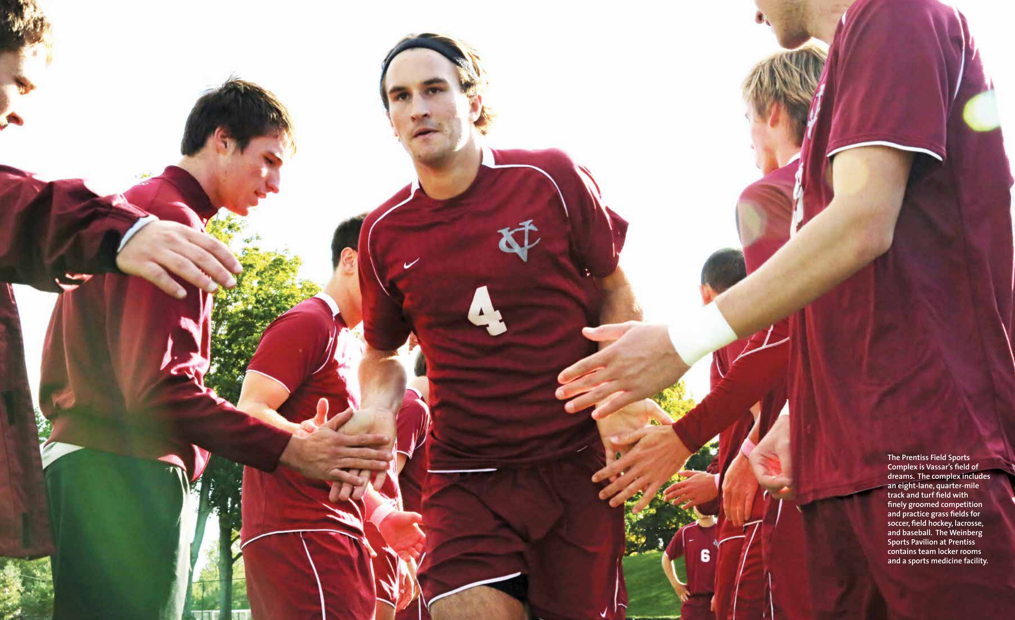
The Prentiss Field Sports Complex is Vassar's field of dreams. The complex includes an eight-lane, quarter-mile track and turf field with finely groomed competition and practice grass fields for soccer, field hockey, lacrosse, and baseball. The Weinberg Sports Pavilion at Prentiss contains team locker rooms and a sports medicine facility.